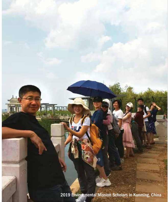
2019 Environmental Mission Scholars in Kunming, China