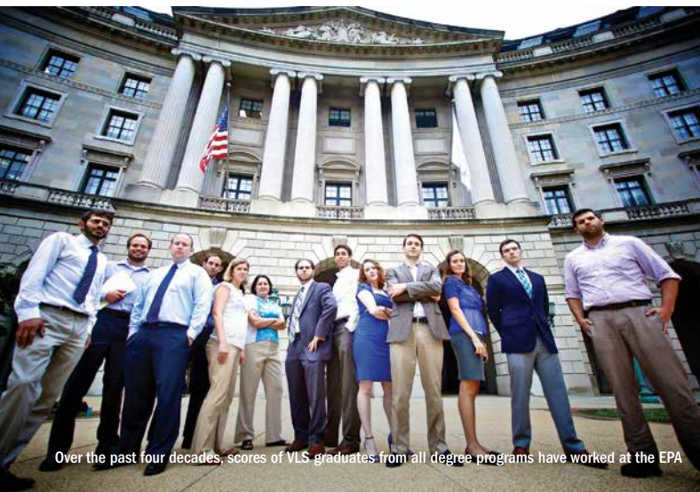
Over the past four decades, scores of VLS graduates from all degree programs have worked at the EPA

In addition to the traditional Juris Doctor degree, Vermont Law School offers a number of master's degrees, LLM degrees, joint degrees, dual degrees with other academic institutions, certificate programs, and the renowned Summer Session program. These programs range from the Master of Environmental Law and Policy, which VLS has awarded to over 2,500 students since the program's inception in 1978, to the LLM in Food and Agriculture Law, which welcomed the first students in fall 2015. The master's degrees may be completed in as little as one year or up to five years. Students have the choice and flexibility to complete a master's or LLM degree on campus or online, or a hybrid of both.