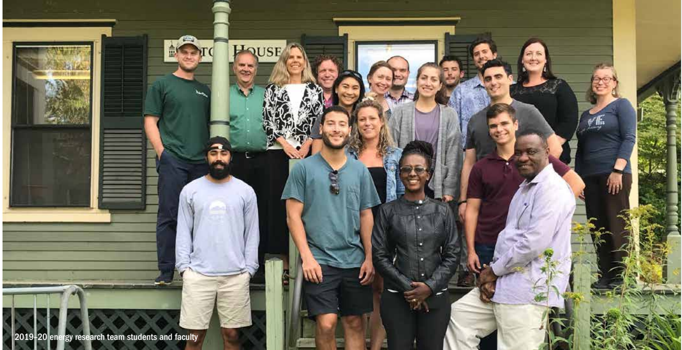
2019-20 energy research team students and faculty