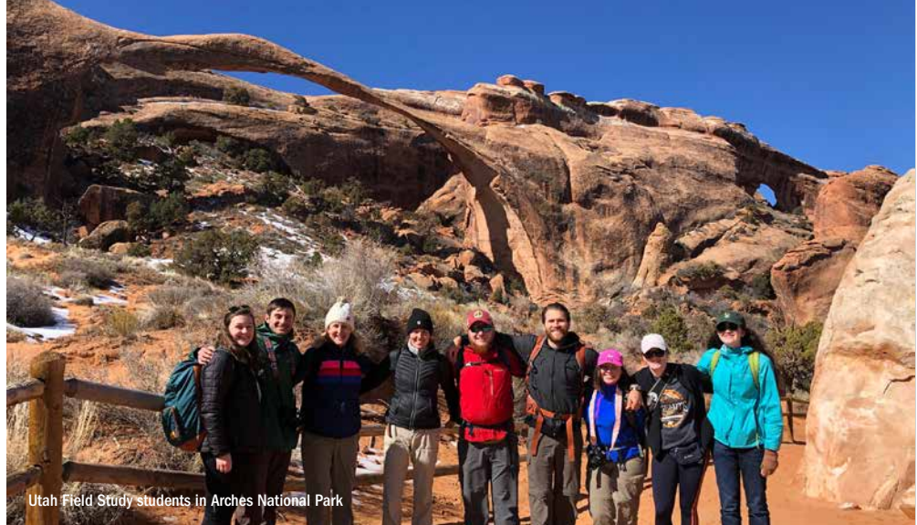
Utah Field Study students in Arches National Park

The legal issues around donation of conservation easements and private/public partnerships for land conservation