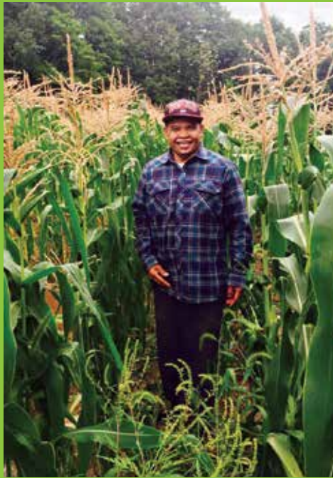
BOSTON AREA GLEANERS

If a food donor's deduction exceeds their taxable income, the federal code allows the donor to apply the remainder to subsequent years, up to five years. 24 Generally, smaller growers do not have a high enough income to make a one-time deduction worthwhile. 25 Thus, the ability to roll the deduction over to future years is vital for growers to realize a monetary incentive to donate agriculture crops and products.