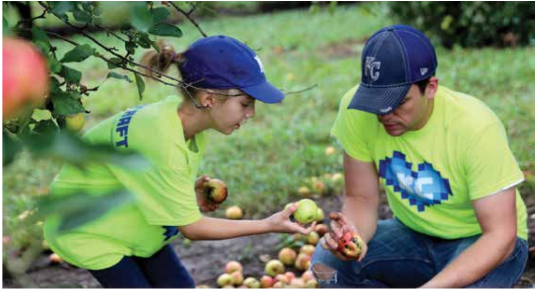
AFTER THE HARVEST