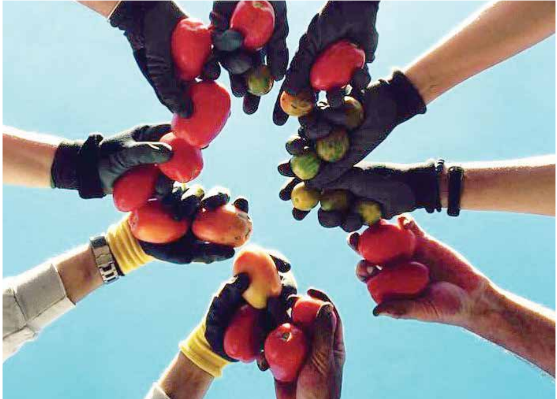
BOSTON AREA GLEANERS

This Report was produced by Vermont Law School's Center for Agriculture and Food Systems (CAFS) with funding from the National Agriculture Library, Agricultural Research Service, United States Department of Agriculture.