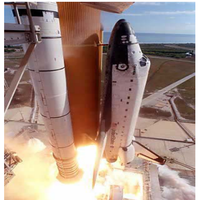
Columbia's Final Voyage January 16, 2003