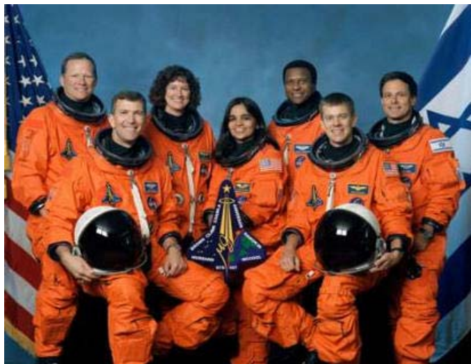
Front row: Astronauts Rick D. Husband (left), mission commander; Kalpana Chawla, mission specialist; and William C. McCool, pilot. Standing: Astronauts David M. Brown, Laurel B. Clark, and Michael P. Anderson, all mission specialists; and Ilan Ramon, payload specialist representing the Israeli Space Agency.