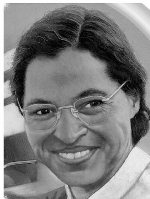
Rosa Louise Parks