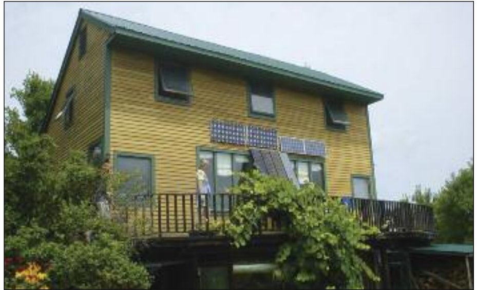
Building design is key. South-facing orientation provides much of this home’s heat while the roof overhang, insulated curtains, careful placement of windows for x-ventilation and semi-earth-sheltered features keep it comfortable year-round.

According to the most recent reports from Vermont’s Department of Public Service (2005 and 1998), 85% of the money Vermonters spent on energy flowed away from the state. Vermont, like the rest of the nation, is heavily dependent on foreign sources of supply that are increasingly insecure and unpredictable. Energy costs will continue to escalate, and demand continues to increase at unparalleled rates. Efficiency and conservation measures can save money and make funds available, that