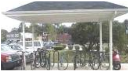
Offering a place that keeps bikes dry encourages their use.

important contributions to long-term housing affordability. Reducing individual building energy consumption, combined with reduction of driving miles due to increased development density, leads to immense reductions in a community's overall energy use and carbon emissions.