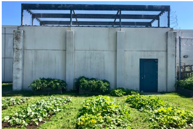
The farm at Maine State Prison

New England states could take a cue from their other strong local procurement initiatives to meet multiple state goals and priorities, including improved health outcomes and support for locally and sustainably produced food. At least one Maine correctional facility has been lauded for its efforts to grow produce for meals at the facility while providing training and some degree of respite from the danger and boredom of prison. 23 However, programs like these