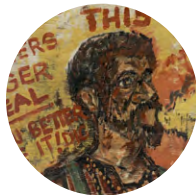
Hunger’s Wall: Tell It Like It Is