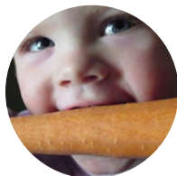
Hunger Through My Lens