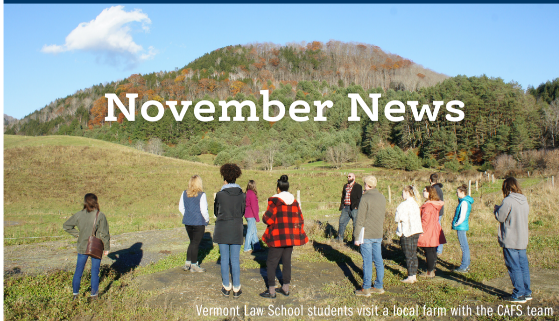
Vermont Law School students visit a local farm with the CAFS team