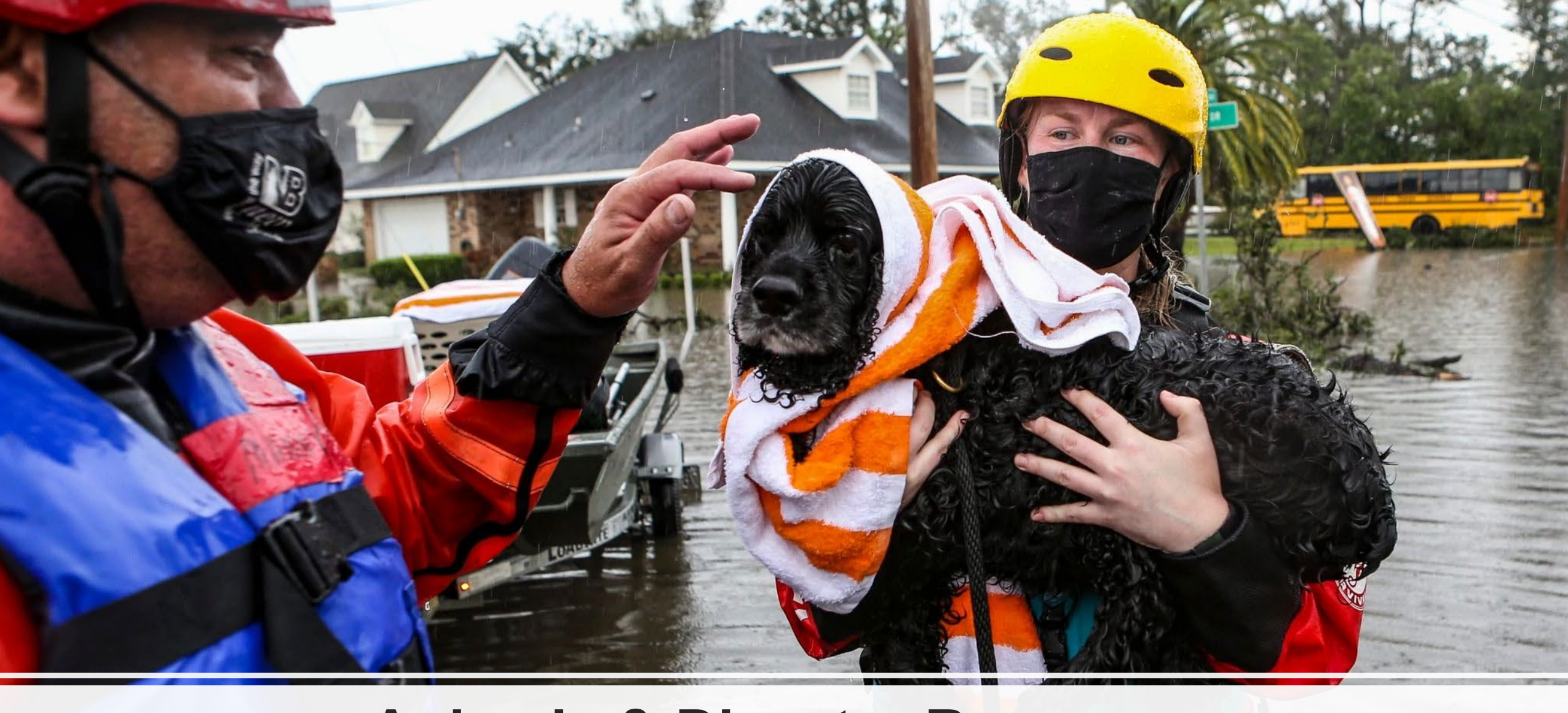
Animals & Disaster Response