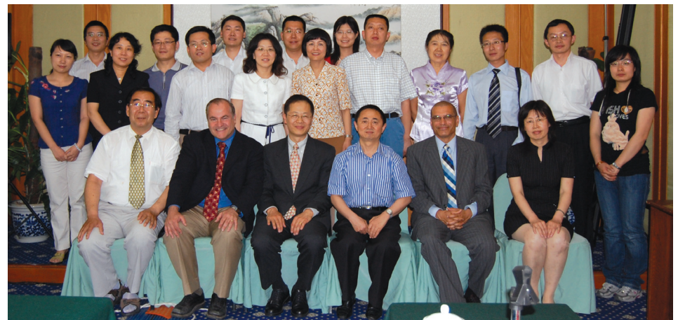
Speakers and scholars at the Environmental Law Research and Teaching Workshop in Beijing