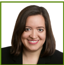
Table of Former Immigration Judges and has been a speaker and/or moderator on many CLE panels for the NJSBA/NJICLE over the years, as well as for AILA national, regional, and local conferences, NYSBA, the Federal Bar Association, the American Bar Association, and many others.